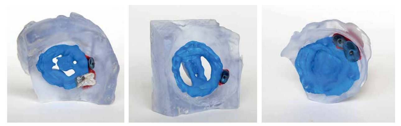
Figure 3. Printed PVL models with tested occluders